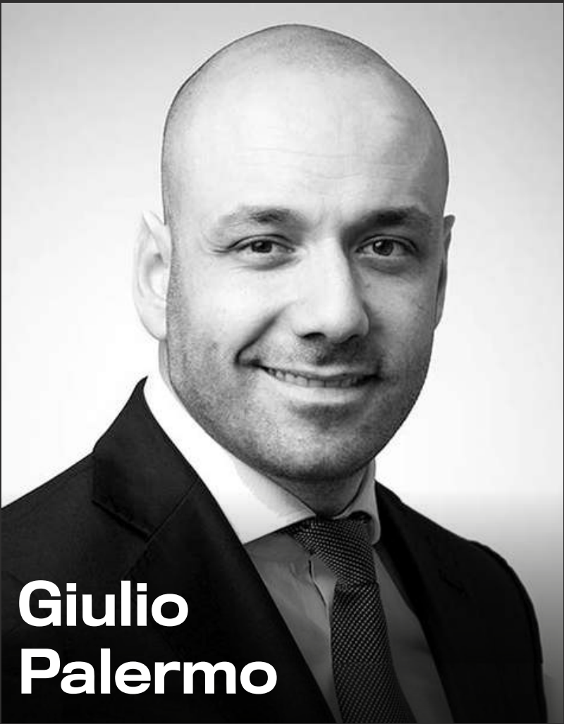
Partner at Archipel , CAS Arbitrator, and UEFA Ethics and Disciplinary Inspector.