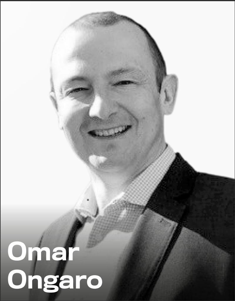
Of Counsel Morgan Sports Law and CAS Arbitrator