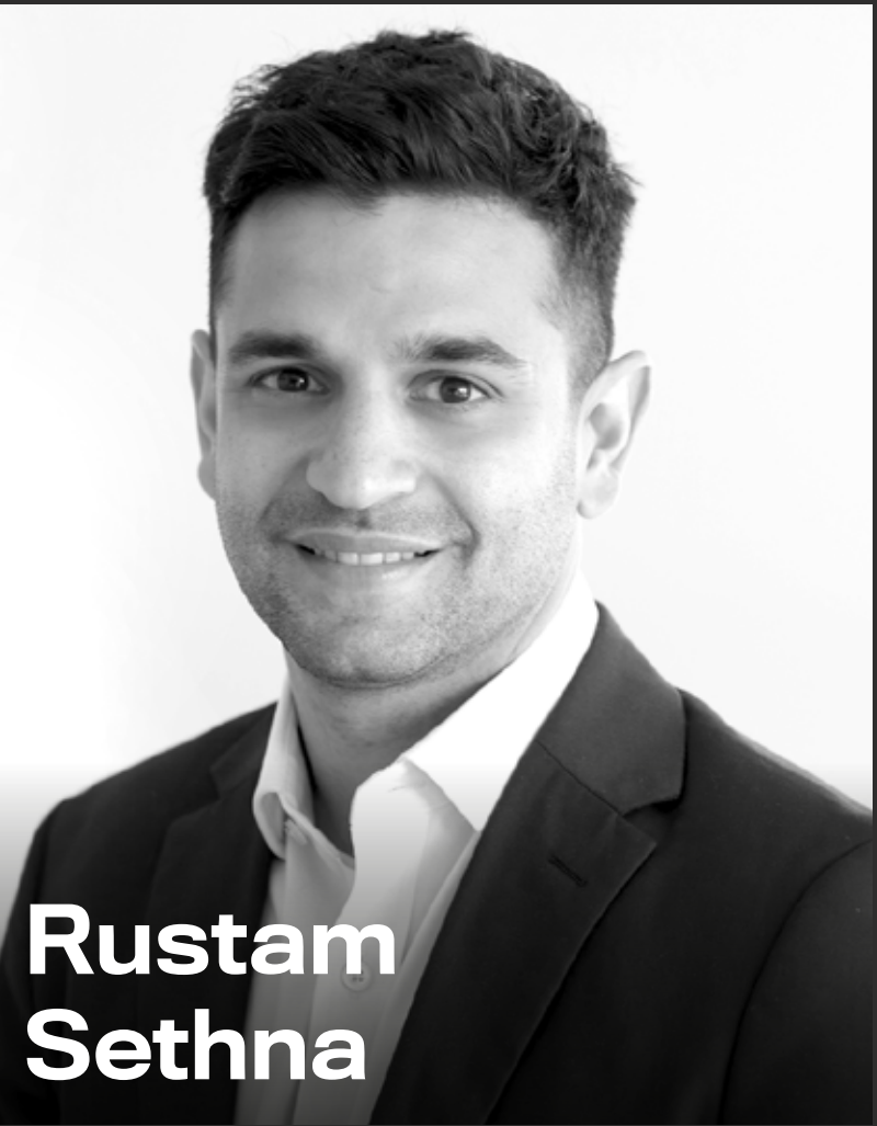
Senior associate on the sports law team at Mills & Reeve