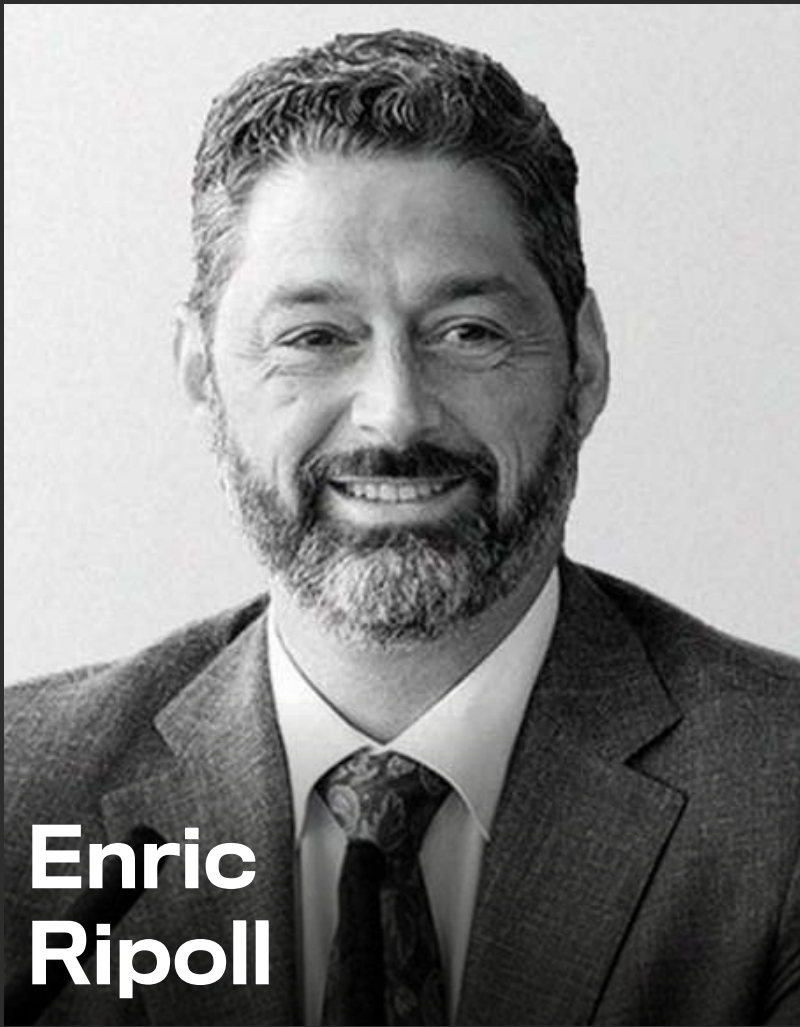
Founder and CEO of ER Sports Law & Arbitration

Faculty participation may be subject to change.