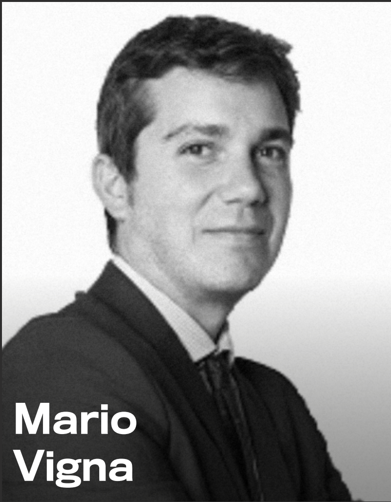
Partner in Coccia De Angelis & Associati